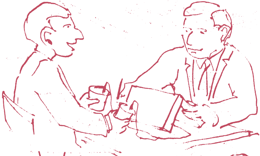
He'll help you a little.