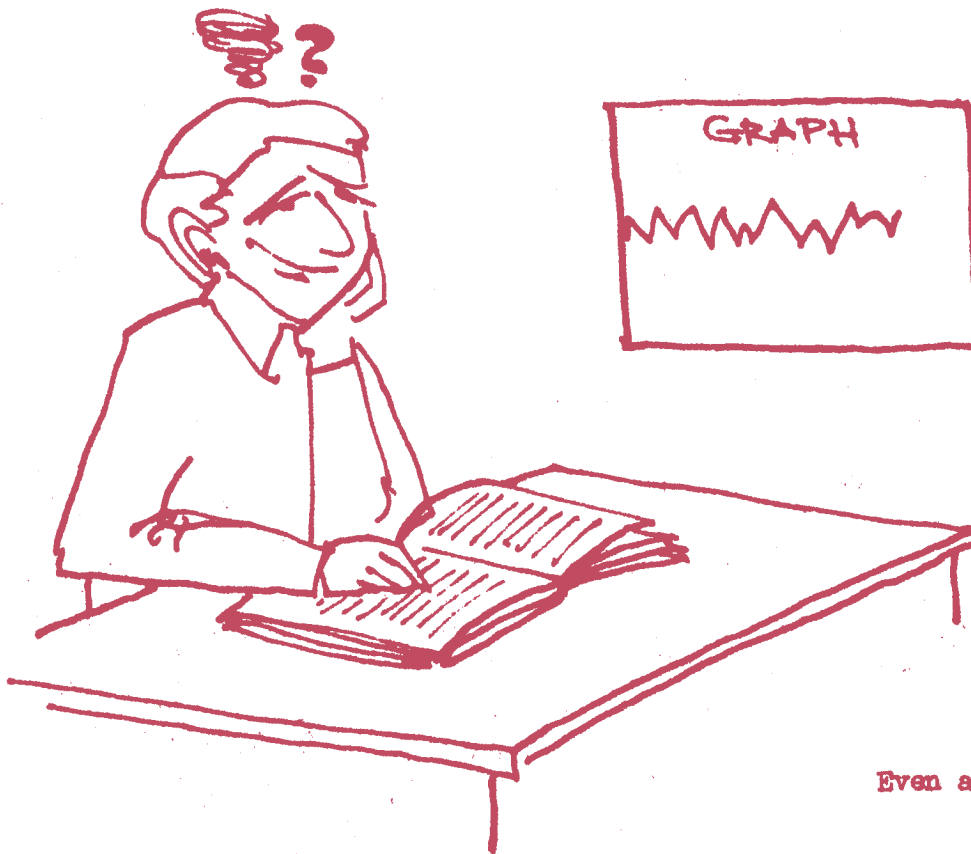
Even a little?