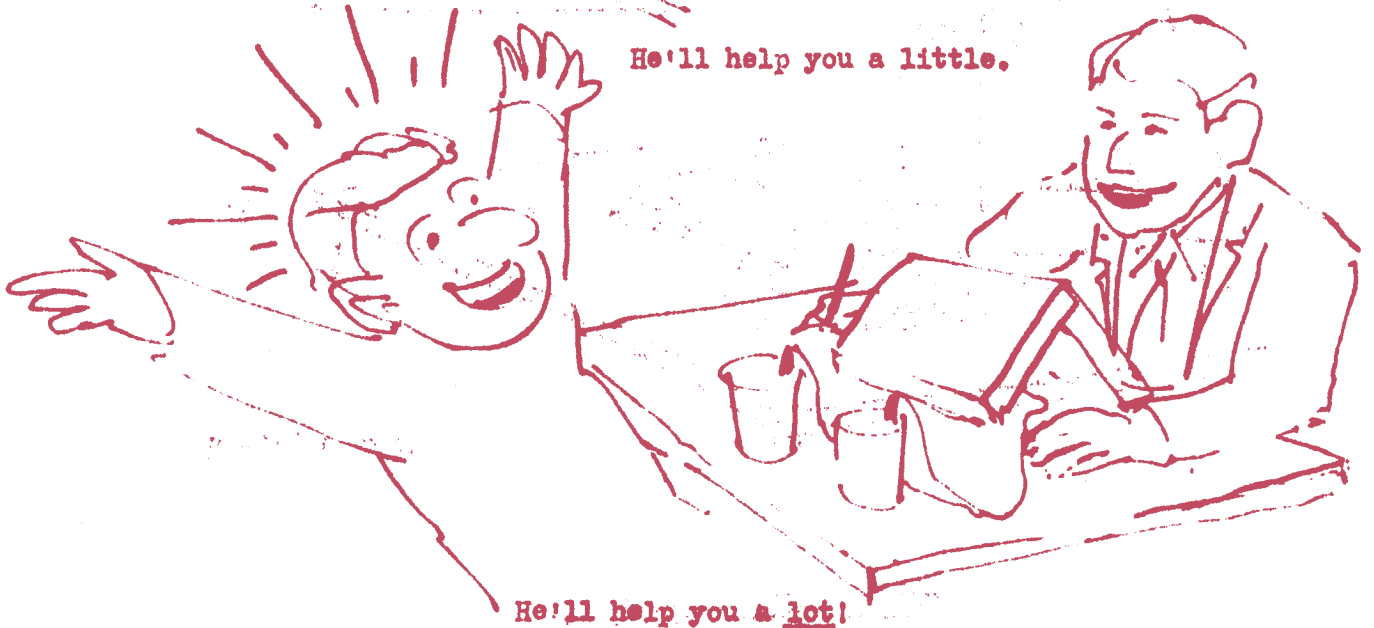
He'll help you a lot!

A sweepingly Fantastic discovery in the field of Education. - LRH.