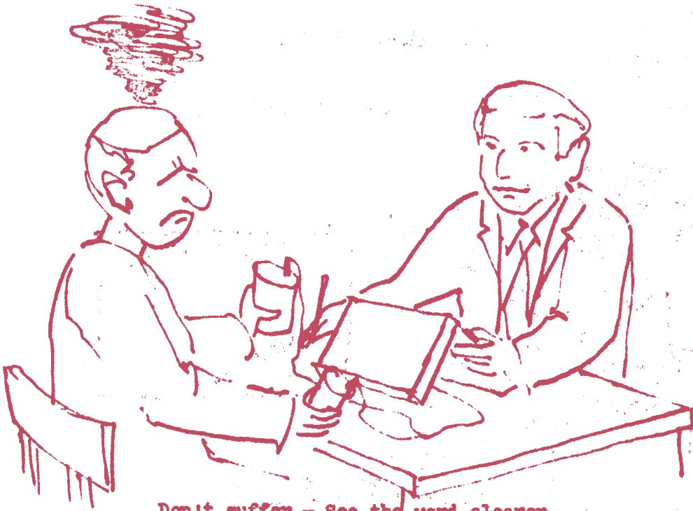
Don't suffer - See the word clearer